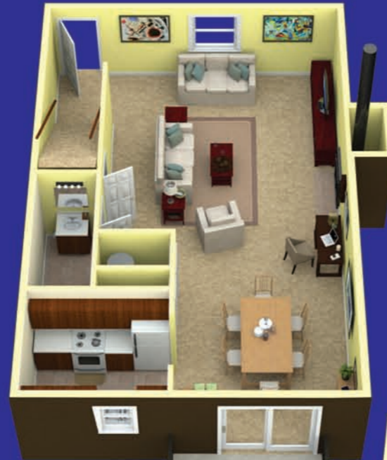
Two Bedroom One & Half Bath Townhome 1000 sq. ft.

Living Room: 11'7" x 17'1" Dining Room: 8'1" x 8'1" Bedroom: 11'5" x 14'10"