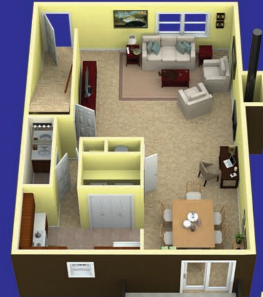
Three Bedroom One & Half Bath Townhome 1200 sq. ft.

Living Room: 13'10" x 16'1" Dining Room: 8'7" x 10'4" Bedroom: 9'3" x 13'10" Master Bedroom: 11'1" x 14'10"