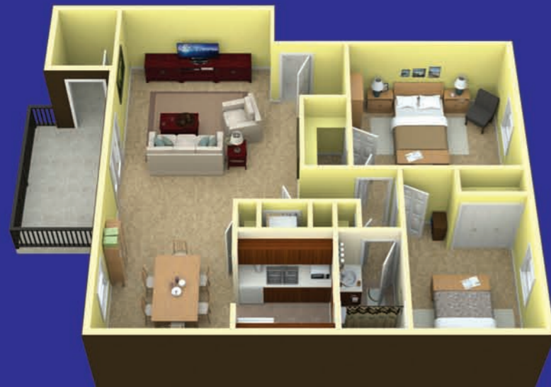
Two Bedroom One Bath 900 sq. ft.

Living Room: 18'4" x 14'1" Dining Room: 12'2" x 9'1" Bedroom 1: 9'1" x 12'0" Bedroom 2: 8'11" x 11'0" Master Bedroom: 11'0" x 14'11"