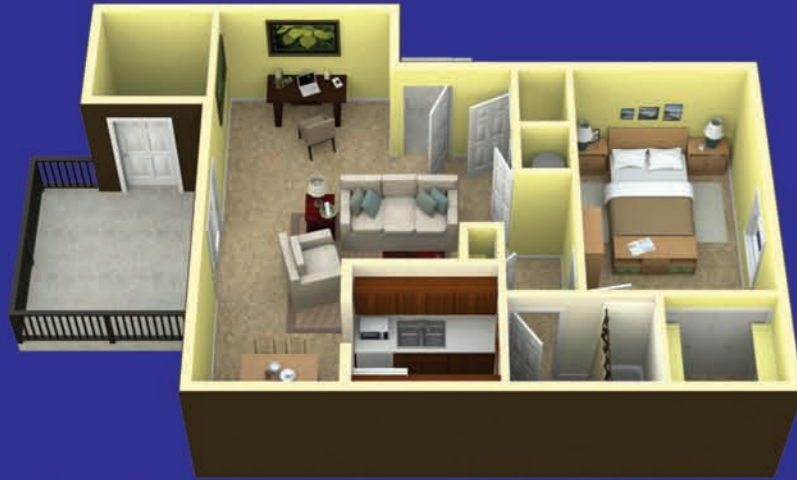
One Bedroom One Bath 700 sq. ft.